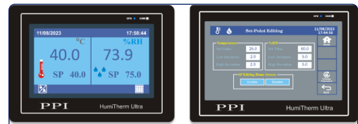
Optional HMI Control